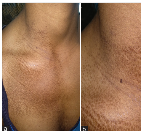
Figure 1: (a and b) Numerous, hyperpigmented, folliculocentric macules seen over the right side of the chest, extending onto the neck as well as the shoulder. They tend to be coalescing towards the center

Histopathology demonstrated hyperpigmentation of the basal layer with regular elongation of rete ridges. There was acanthosis present. This hyperpigmentation corresponds clinically to the hyperpigmented macules. There was no evidence of dermal smooth muscle