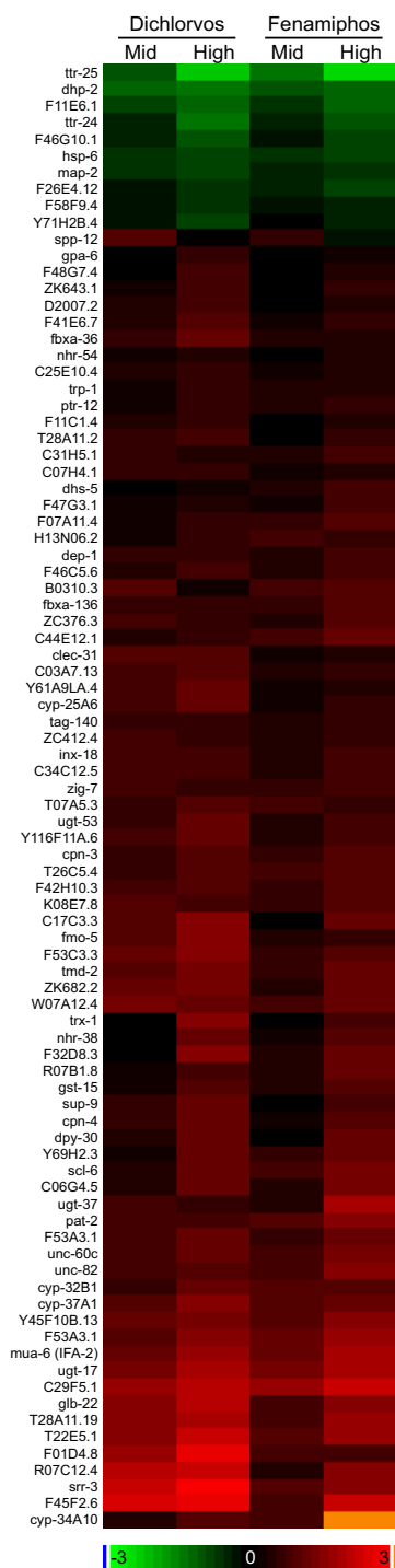
Figure 2 Changes in expression levels of genes specifically affected by OP exposure. Heatmap depicting the average changes in expression levels of genes affected by OP exposure. Gene or sequence names are shown at the left of the heatmap. The color bar indicates \log_2 differences from the control for each chemical. Concentrations are based on SVM predictions.

The digested peptides were desalted, dried under vacuum, reconstituted in 10% acetonitrile, and fractionated using mixed mode ion chromatography with a Polycat A column and Polywax LP column in series (PolyLC Inc., Columbia, MD). Eight time based fractions were collected. Each fraction was analyzed using a nanoACQUITY UPLC coupled to a QTOF Premier quadrupole, orthogonal acceleration time-of-flight tandem mass spectrometer (Waters, Milford, MA). Data were collected over the 50–1990 mass to charge ( m/z ) range using the Waters Protein Expression MS E method, which alternates between low energy scans to survey the precursor ions and high colli-