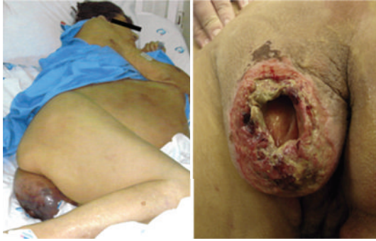
FIGURE 1: Hyperemic mass in the left perineum and left buttocks, that progressed to skin necrosis and perforation.