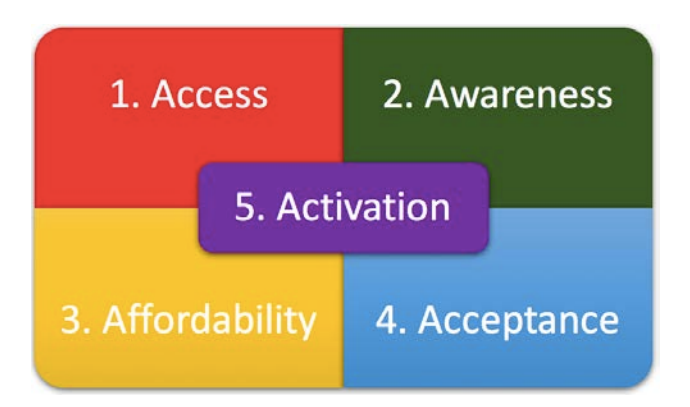
Figure 1. The key alignments for successful vaccination programmes.

Vaccination programmes globally are facing new challenges, including vaccine hesitancy, anti-vaccine lobbying, and the emergence of new communicable diseases. Globally, the success of vaccination programmes, in general, is achieved with the alignment of the "five As"—Access, Affordability, Awareness, Acceptance, and Activation (Figure 1). Maternal immunization programmes are no exception to this ground rule.