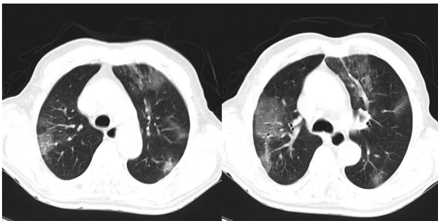
FIGURE 1 Spiral chest CT scan indicating multilobular patchy and ground-glass opacities in favor of COVID-19. CT scan, computed tomography scan

In 2019, Zhang et al 5 conducted an animal study on rats and grouped them into three groups of Sham, sepsis-caused acute lung injury, and an intervention group with sepsis-caused acute lung injury receiving EPO. The intervention group showed less severe pulmonary interstitial, and alveolar edema, hemorrhage, or lung collapse compared to Sham and sepsis-caused lung injury groups. The protective effects of EPO towards lung tissue were attributed to its effects in inhibiting expression of nuclear factor- \kappa B (NF- \kappa B) in lung tissues, inhibition of interleukin-6 (IL-6) and tumour necrosis factor alpha as proinflammatory cytokines, and improvement of anti-inflammatory cytokine IL-10 levels. A similar study was also conducted to assess rhEPO effect on human respiratory epithelial cell apoptosis and detected cytoprotective effects of rhEPO through induction of an antiapoptotic Bcl-xL/Bax phenotype 6 (Figure 2).