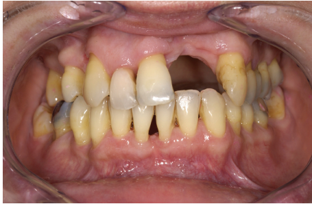
FIGURE 1: Upper jaw with missing central and lateral incisors in the second quadrant and large defect of the alveolar ridge.