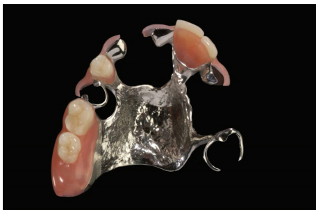
FIGURE 2: Removable partial denture with denture saddles and retentive clasping arms made from polyamide-12. The conventional CoCrMo framework ensures rigidity of the denture despite the flexibility of the denture resin material.

and softening [18]. However, the conditions in which these dentures were processed were far from ideal [18]. The objective of this study was to investigate a modern polyamide-12 processed using specialized laboratory equipment for its potential discoloration, change in elasticity, and surface roughness in different storage media and after thermocycling. PMMA served as a control. The following null hypotheses were stated.