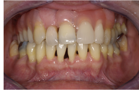
FIGURE 3: Removable partial denture in situ. The polyamide-12 retentive clasping arms are almost invisible.

Polyamide-12 specimens (Valplast, Valplast International Corp., Long Beach, NY, USA, LOT 111224) were fabricated, each measuring 40 \times 10 \times 2 mm. Wax patterns were embedded in formaldehyde-free stone (Weiton-Biogips Typ 4, Weithas Corp., Lütjenburg, Germany) and polyamide-12 was injected at a temperature of 290^\circ\text{C} and a pressure of 6.5 bar according to the manufacturer's instructions using the Valplast injection system (Valplast International Corp., Long Beach,