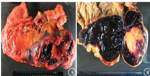
Figure 2 Macroscopic findings of the colon mass. A huge lobulated soft mass, measuring 20 × 13 × 10 cm, is noted at the ascending colon(A). Cut surface is mostly hemorrhagic gelatinous with small portion of yellowish gray solid nodule(B).

Macroscopic examination of the ascending colon revealed a large, lobulated, dumbbell-shaped soft mass that measured 20 × 13 × 10 cm, along the mesenteric border (Figure 2A). A portion of tumor was exposed and underlying hematoma was observed. Upon opening the intestine, the mucosa was discolored but intact. Upon sectioning, the cut surface was soft, friable, dark-red, and gelatinous, with a focal, yellowish-gray, solid portion, and hemorrhage (Figure 2B). Microscopic examination demonstrated loose proliferation of stellate or spindle cells on myxoid stroma, with occasional mature lipocyte-like cells (Figure 3A). They were supported by thin arborizing vasculature (Figure 3B). Rare multivacuolated lipoblasts were found (Figure 3C). Tumor cells extended upward to the submucosa, accompanied by extensive submucosal hemorrhage, but the overlying mucosa was intact (Figure 3D). The retroperitoneal masses were multiple, isolated, or conglomerated, golden to pale-yellow, glistening solid nodules, which measured 12 cm in their largest diameter. Their microscopic findings were compatible with well