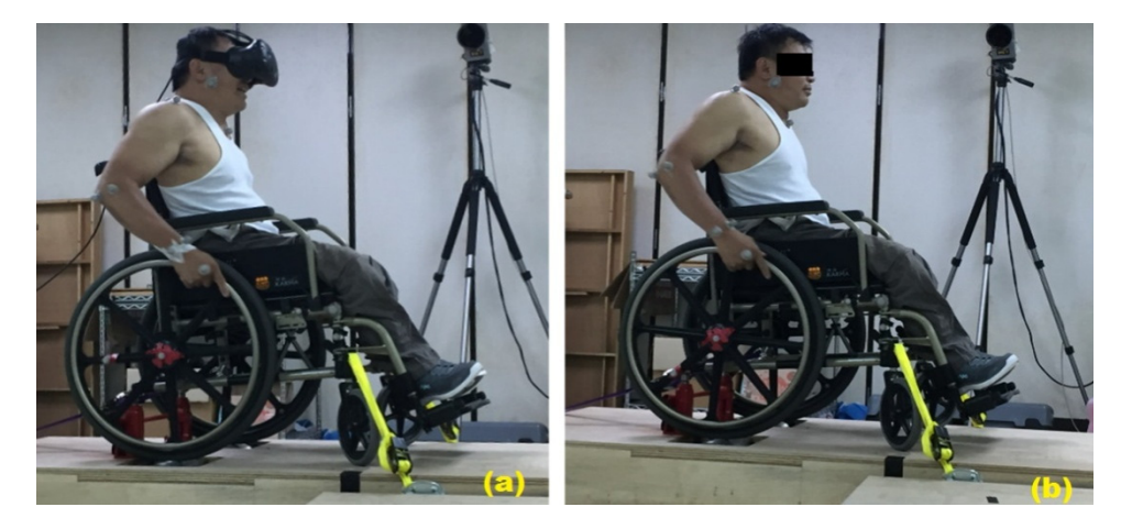
Figure 1. Participant pushed the wheelchair with (a) and without HMD (b) on a stationary ergometer.

In order to collect their own propulsion performance in nature, participants were asked to push their own wheelchairs, protected by 4-point tie-down straps, on a stationary ergometer at comfort speed for 30 s. The trunk, bilateral upper extremity, and wheel kinematics were obtained using a six-infrared camera motion capture device (Qualisys AB, Gothenburg, Sweden) with 15 reflective markers on the body and the wheel (Figure 1). Subsequently, participants were asked to wear an HMD-based VR (HTC Vive) and underwent 2 min of basic wheelchair maneuvers, such as turning the wheelchair to the left and right, pushing the wheelchair forward a short distance, crossing the intersection of traffic, and driving uphill in a virtual environment. Once they got used to the VR environment, they were asked to operate their own wheelchairs in the following VR scenarios: on level ground at a comfortable speed and in uphill conditions. Three 10 s trials of kinematic data during these two episodes were recorded for the above two conditions and were averaged for further statistical analysis.