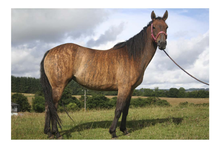
Figure 1. Phenotype of an affected horse. Brindled pigmentation and patches of hairless skin are visible. The hairless skin probably represents scarring alopecia following the different stages of skin lesions described. The patterns of hyperpigmentation and the skin alterations follow the lines of Blaschko. The depicted horse corresponds to animal III-10 in the pedigree shown in Figure 2. doi:10.1371/journal.pone.0081625.q001

We sequenced the whole genome of one affected mare in order to get a comprehensive overview of all sequence variants (animal II-8 in Figure 2). We collected 225 million 2 \times 100 bp paired-end reads from a shotgun fragment library corresponding to roughly 19 \times coverage of the genome. We called SNPs and indel variants with respect to the EquCab 2 reference genome and identified