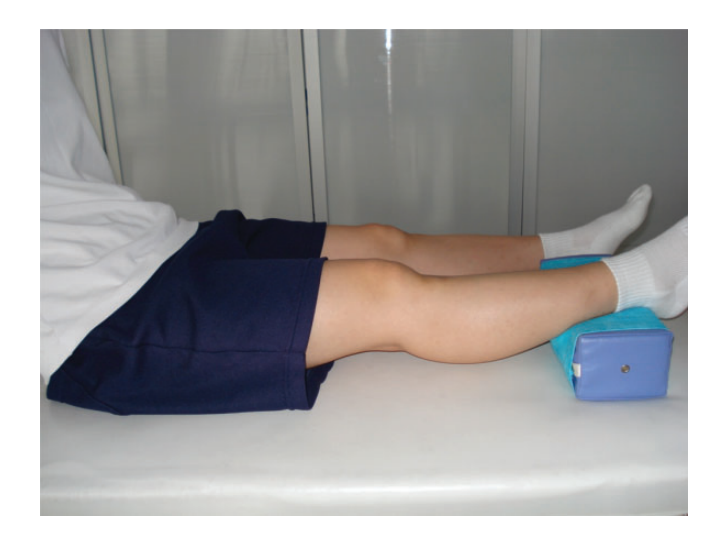
Figure 2. Beighton and Horan Joint Mobility Index measure: knee extension.