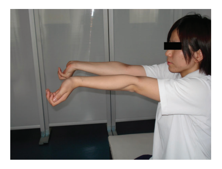
Figure 1. Beighton and Horan Joint Mobility Index measure: elbow extension.