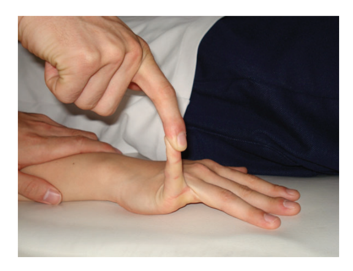
Figure 3. Beighton and Horan Joint Mobility Index measure: little finger extension.