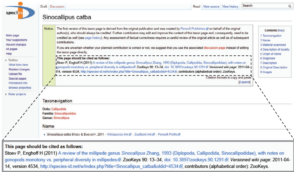
Figure 1. Citation template for the simultaneous journal and wiki publication of Sinocallipus catba Stoev & Enghoff, 2011 (generic link: http://species-id.net/wiki/Sinocallipus_catba , permanent link of the version depicted in the figure: http://species-id.net/w/index.php?title=Sinocallipus_catba&oldid=4534 ). The generic link always points to the most recent version of the page, while a permanent link is specific to one particular revision.

ogy and others) into sections of the wiki page. In addition, it converts reference lists and identification keys, exports taxon images and places them on the wiki page. At the same time, the PWC uses several wiki templates to facilitate the display of recommended citations, taxonomic classifications and other content elements in a way that is consistent across the site and easily editable as well. Several of the hyperlinks present on