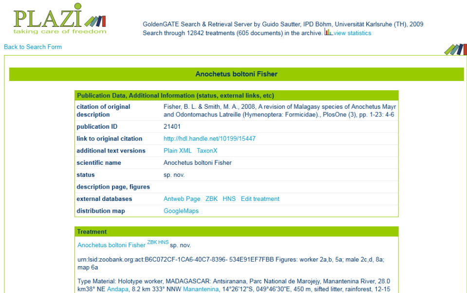
Figure 3. Treatment of Anochetus boltoni Fisher extracted through XML markup from the original paper of Fisher and Smith (2008) and deposited at the Plazi Treatment Repository ( www.plazi.org ).

Conversely, the hyperlinked URL of the generic wiki page for each taxon treatment is published in the original journal publication, right next to the taxon treatment name (Fig. 2).