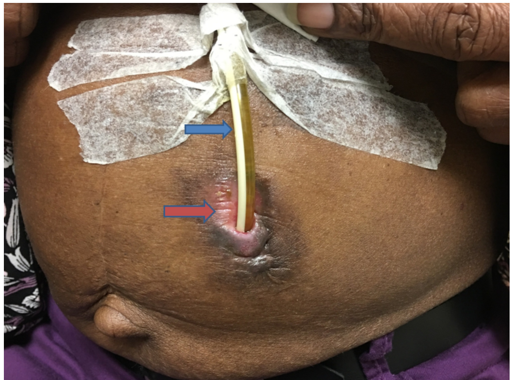
FIGURE 1: Image of the abdomen showed replacement PEG tube placed in situ at the left upper quadrant. Blue arrow indicates PEG tube and red arrow indicates the clean and uninfected peristomal area.

her food, then pushing it through the tube with a syringe. On examination, we noted a well-healed scar at the base of her neck. The PEG tube was located at the left upper abdomen with no signs of inflammation or drainage at the peristomal area (Figure 1).