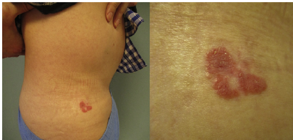
Fig 1. Close-up of the lesion on the right hip of the patient.