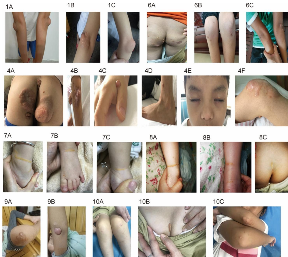
Fig. 1 Xanthomas of STSL patients. The numbers are the case numbers in Table 1

HoFH cases with xanthomas as the first presentation were included as controls (Table 2), which included six girls and four boys from eight Chinese pedigrees. The morphology of the xanthomas in the FH group also presented as multiple nodules, partially fused or linear, similar to that of the STSL group. There were no cases of anemia. Four patients (4/10, 40%) had a histological examination of the xanthomas in the FH group, exhibiting numerous foam cells that indicated xanthomas.