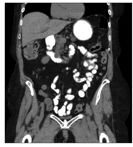
Figure 1 Cross-sectional computed tomography image of the incidentally-identified periampullary mass on coronal view

DOI: https://doi.org/10.20524/aog.2019.0433