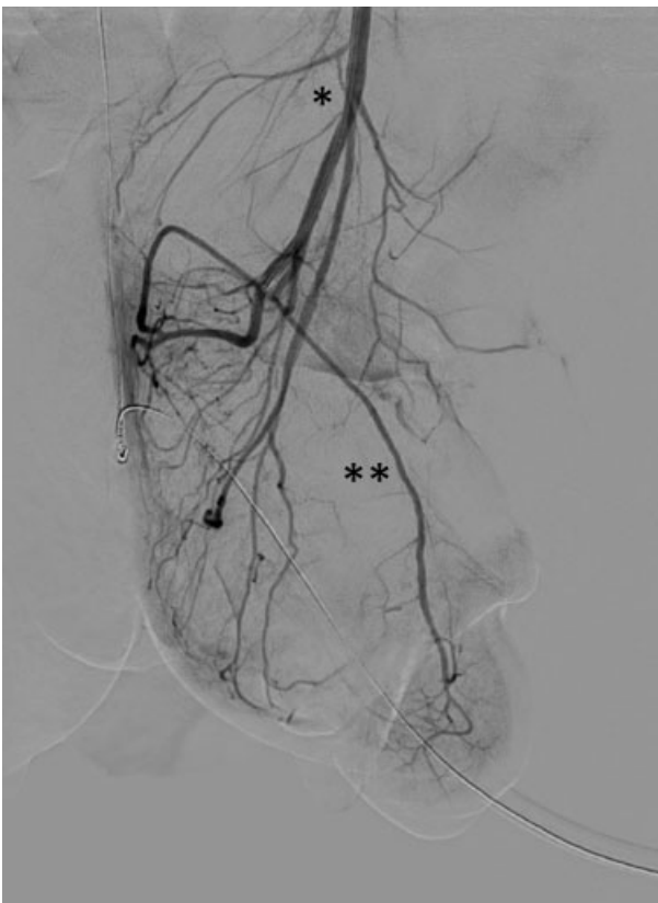
Fig. 2 Digital subtraction angiography (DSA) of the left internal pudendal artery (*) via microcatheter (Progreat 2.7F, Terumo) confirmed a sufficient arterial perfusion of the glans with good contrast filling of the dorsal artery of the penis (**).