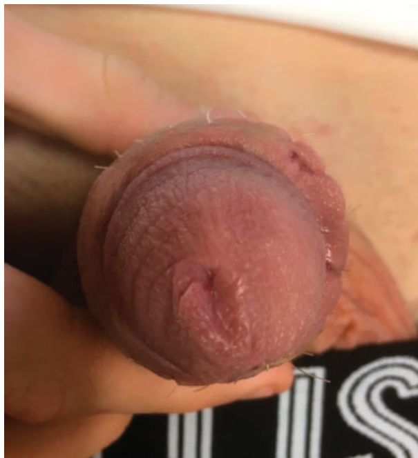
Fig. 4 After treatment, glans ischemia resolved completely (seventh postoperative day after angiography).

monopolar cautery, DPNB has been suggested to be the most frequent cause of this complication. 4,9 In a large cohort from Singapore analyzing 3,909 DPNB, the total complication rate was reported to be as low as 0.23%. 10 Other authors also report on ischemia of the glans penis following DPNB for circumcision. 6,7,11 As an alternative for DPNB, topical anesthetics have been evaluated but did not provide sufficient perioperative analgesia. 12 Kaplanian et al suggested to limit the volume of local anesthetic solution to an amount of 0.2 mL/kg (up to maximum of 10 mL). 7 In our patient, the primary surgeons exceeded this dose and applied 15 mL of plain bupivacaine on each side. Therefore, this could have led to a transient vasospasm.