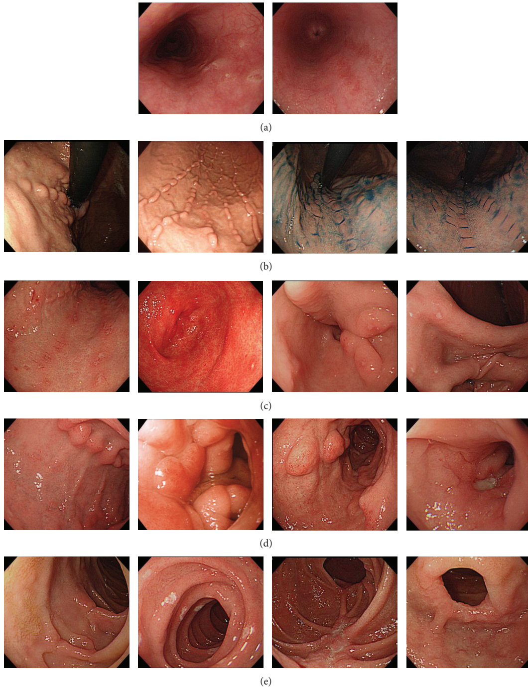
FIGURE 2: Endoscopic findings of UGI lesions specific to CD. (a) Esophagus, (b) upper to mid stomach, (c) lower stomach, (d) duodenal bulb, and (e) 2nd portion of duodenum.

CD mainly affects the ileum and colon, but more recently UGI involvement has gained attention [1, 9, 10]. The reported rate of UGI lesions in CD varies from 1% to about 80%. The difference in the rate of UGI involvement is more likely due to the different criteria that were adopted among the studies. Some studies used histology whereas some studies used macroscopic criteria, like we did. The difference in the age of the patient population may also affect the outcome [11]. However, we presume that the adopted criterion is the largest