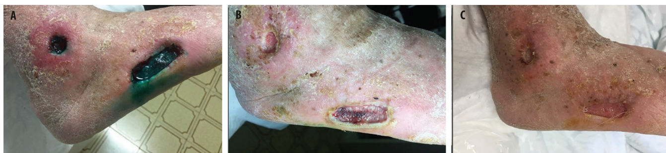
Figure 4. Antimicrobial PDT with RLP068, in addition to amoxicillin/clavulanic acid. (A) Patient condition before treatments. Patient condition after 4 (B) and 16 (C) applications of RLP068-PDT.