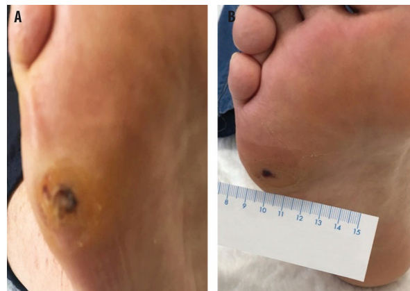
Figure 2. Antimicrobial PDT with RLP068, in addition to amoxicillin/clavulanic acid. (A) Patient condition before treatments. (B) Patient condition after 16 applications of RLP068-PDT.

GLP-1 analogue at the time of presentation. His glycaemic metabolism was controlled (HbA1c=6.9%). An ulcer was present on the lateral aspect of the right foot, within a hyperkeratotic area. The ulcer was graded Texas 1, B stage (Figure 2A). The Winsor index was within normal values; sensory neuropathy was detected. Surgical debridement was performed, after a bacteriological examination that showed infection with Klebsiella pneumoniae . Due to this serious infection, ciprofloxacin 500 mg twice/day was initiated, with antimicrobial RLP068-PDT. The antibiotic was changed into amoxicillin + clavulanic acid 1 g twice/day, due to intolerance. Improvement of the ulcer, with the presence of granulation tissue was observed after 10 PDT applications. The ulcer was cured after 16 applications (Figure 2B). An orthotic was adopted to obtain the offloading of the cured area.