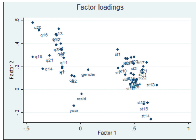
Figure 2: Principal component analysis of parts 2 and 3 of the questionnaire. resid: residence location; year: year of study; st1 to st25: items of the 2 nd part of the questionnaire (evaluation of perceived stress); and q1 to q21: items of the 3 rd part of the questionnaire (evaluation of the pedagogy)

This is the first study to appraise the stress perceived by students, according to their level of satisfaction in the