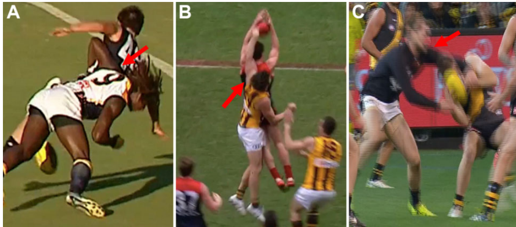
Figure 2. Mechanisms of pectoralis major injury in elite Australian Football League players (arrows): (A) horizontal hyperextension, (B) hyperflexion-abduction, and (C) horizontal adduction (sustained tackling).