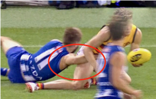
Figure 1. The position commonly reported in the literature in which pectoralis major injuries occur: hyperextension, abduction, and external rotation.

been explored. Knowledge regarding the cause of PM tears could lead to better prevention and management of these injuries at elite and community levels of Australian Rules football and other contact and collision sports.