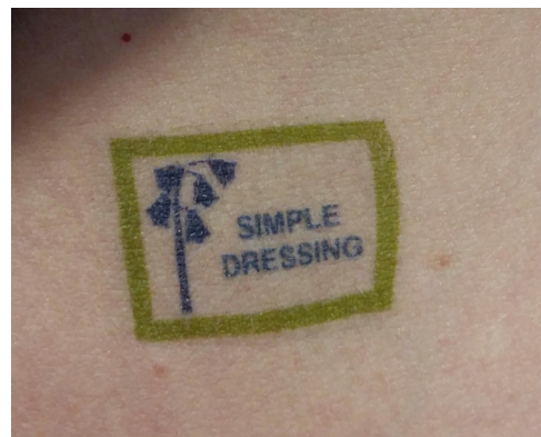
Figure 1 Example of a skin transfer (modelled by a volunteer) that was applied near to the wound(s) to promote adherence to the dressing allocation.

challenges. This paper, therefore, reports the feasibility of conducting the pilot RCT of different dressing strategies and the feasibility of randomising before or after wound closure.