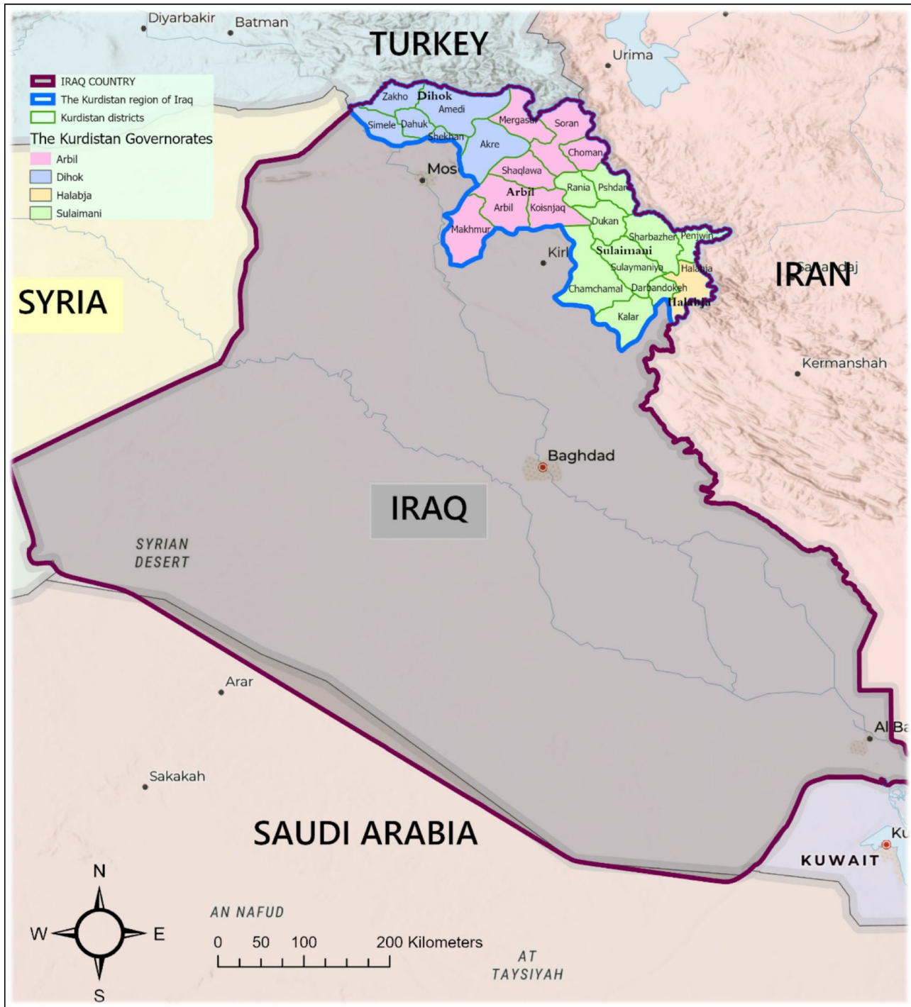
FIGURE 1 The Kurdistan region of Iraq on the Iraq map

preparedness. The functions that instead facilitate implementation of the core activities were identified as support functions, namely standards and guidelines, training, supervision, communication facilities, resources (human, financial, logistical), and coordination between stakeholders. To test the validity and reliability of the survey, a pilot study was conducted in the Sulaimani governorate. The duration of the study was from June 2019 to March 2021.