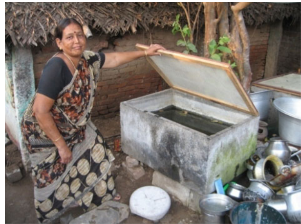
Figure 2 Wooden cover to prevent Aedes breeding in cement tanks.

IEC materials that were locally relevant, culturally understandable and acceptable were designed. These included leaflets on household-based dengue transmission, stickers and posters to raise awareness, and wall banners about the vector breeding habitats and prevention options. These materials were developed in conjunction with state health officials engaged in the dengue control programme on the basis of earlier community-based dengue control experiences. The IEC materials were distributed following a well-defined mechanism involving SHGs and schoolchildren in the intervention clusters.