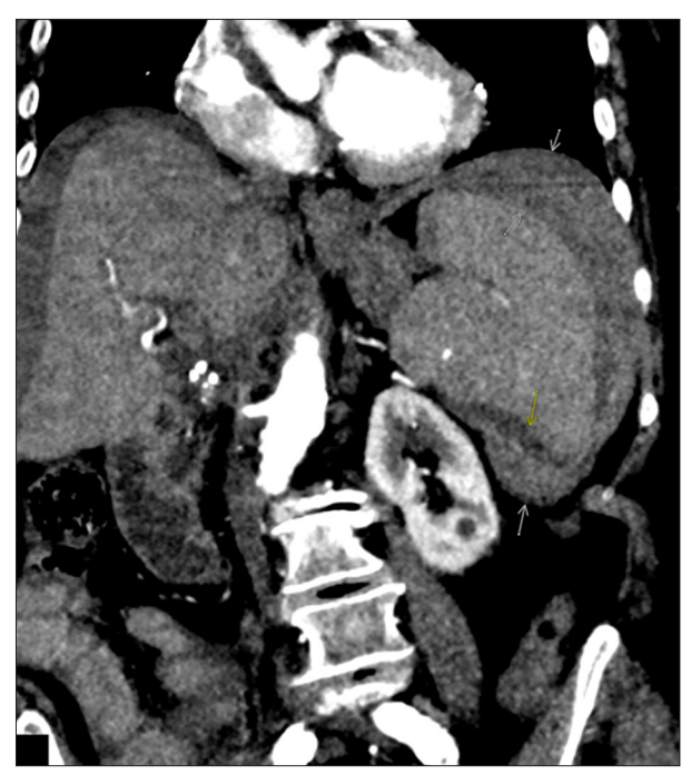
Figure 1. A coronal image from contrast-enhanced CT demonstrates a perisplenic hematoma and hemoperitoneum (white arrows) related to splenic rupture (yellow arrow).