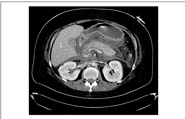
Figure 2. Computed tomography of the abdomen and pelvis axial view showing hypodense pancreas with peripancreatic fluid collection.

amylase 308 U/L (30-110 U/L), lipase 5517 U/L (23-300 U/L), calcium 6.1 mg/dL (8.4-10.2 mg/dL), lactate 3.0 mmol/L (0.7-2.0 mmol/L), bicarbonate 16 mmol/L (22-30 mmol/L), and anion gap 19 (10-14). A computed tomography of abdomen/pelvis showed findings consistent with pancreatitis with peripancreatic fluid but no evidence of pseudocysts or walled-off necrosis (Figures 1 and 2). Her clinical presentation was consistent with the diagnosis of severe HTG-AP.