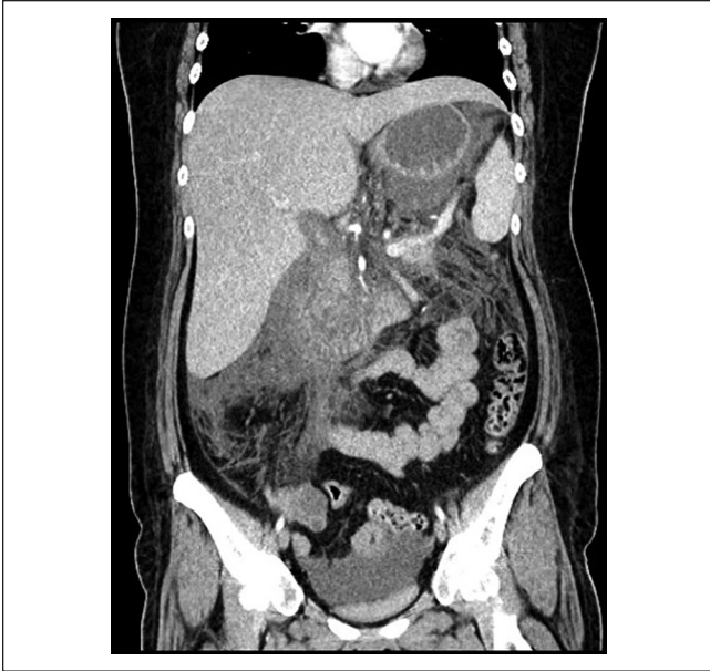
Figure 1. Computed tomography of the abdomen and pelvis coronal view showing extensive peripancreatic fluid collection.