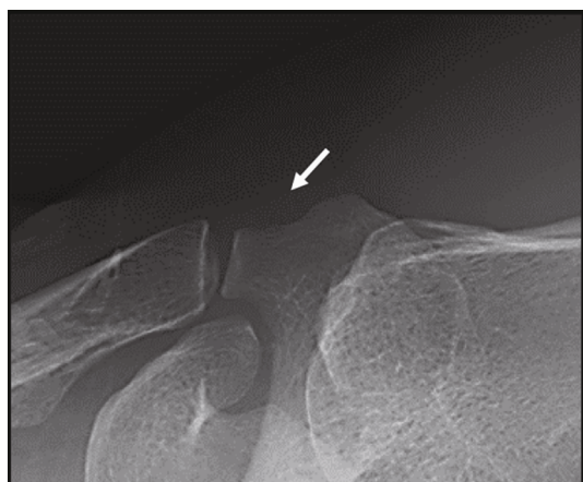
FIGURE 3: Plain radiograph with the arm in an elevated position showing the disappearance of calcification.

been reported in the literature, those in acromial attachment site of the deltoid have not been reported [7].