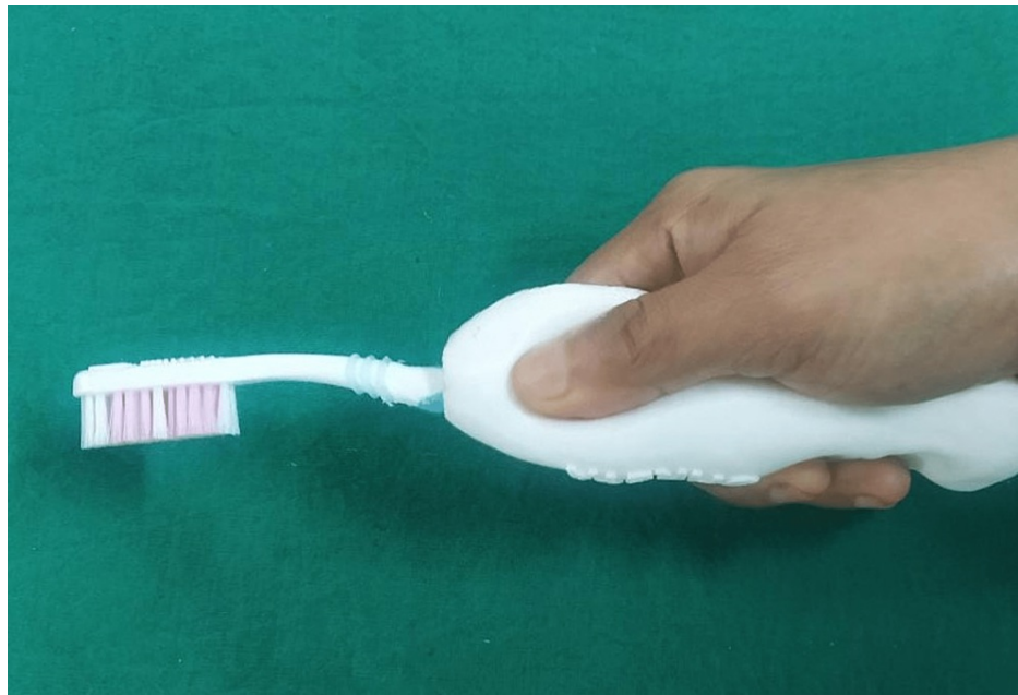
FIGURE 5: 3D printed handle with toothbrush.