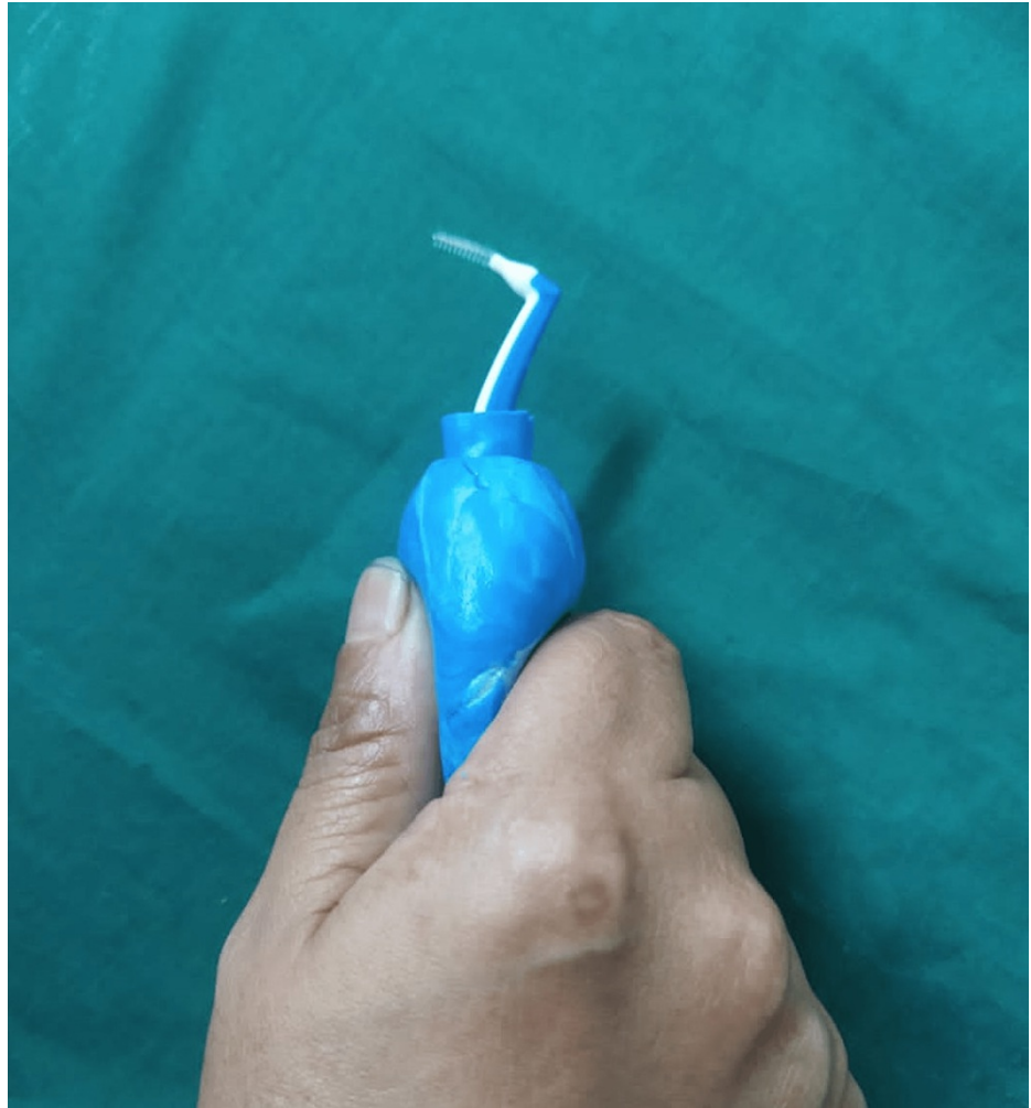
FIGURE 2: Correct fit of interproximal handle into toothbrush handle.

Fabricate both the customized handle with 3D printing software Mimics (Materialise NV; Belgium) (Figure 3).