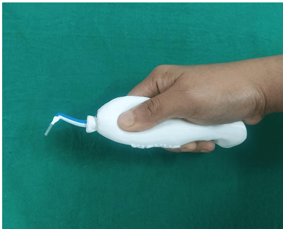
FIGURE 6: 3D printed handle with interproximal brush.

Instruct the patient about the handling of the toothbrush and interproximal handles. Explain to the patient that once brushing is completed with a customized handle, insert an interproximal brush with its handle into the toothbrush handle to carry on with oral hygiene.