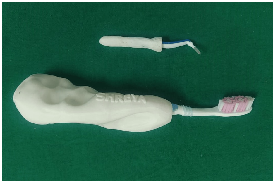
FIGURE 4: 3D printed handle.

Print using polylactic acid material with a 3D printer Ultimaker 2+ (Ultimaker BV; North America) (Figure 4).