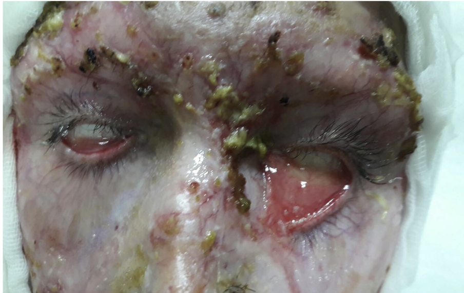
Fig. 1. Cicatricial ectropion in both lower eyelids, left eye more affected, before the surgery.

institution for surgical treatment of the cicatricial ectropion of both lower eyelids and exposure keratopathy due to severe deep dermal burns that affected minimally 60% of the TBSA (Fig. 1).