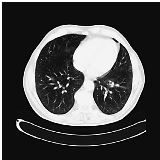
Fig. 1. Computed tomography scan performed after 6 cycles of adjuvant FOLFOX therapy showing normal finding.