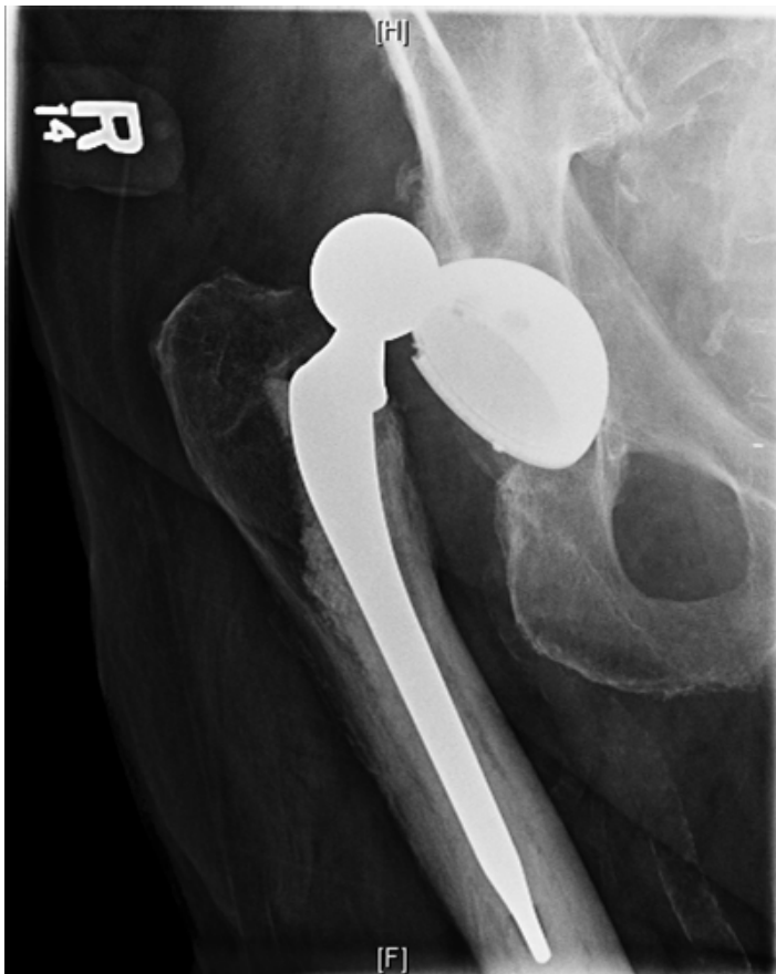
Image 1. Anterior-posterior radiograph of the patient's right hip demonstrating the hip prosthesis dislocated superiorly. Lateral films (not shown) indicated posterior displacement as well.

The patient then received a femoral nerve block following the three-in-one technique outlined previously (Image 2). The