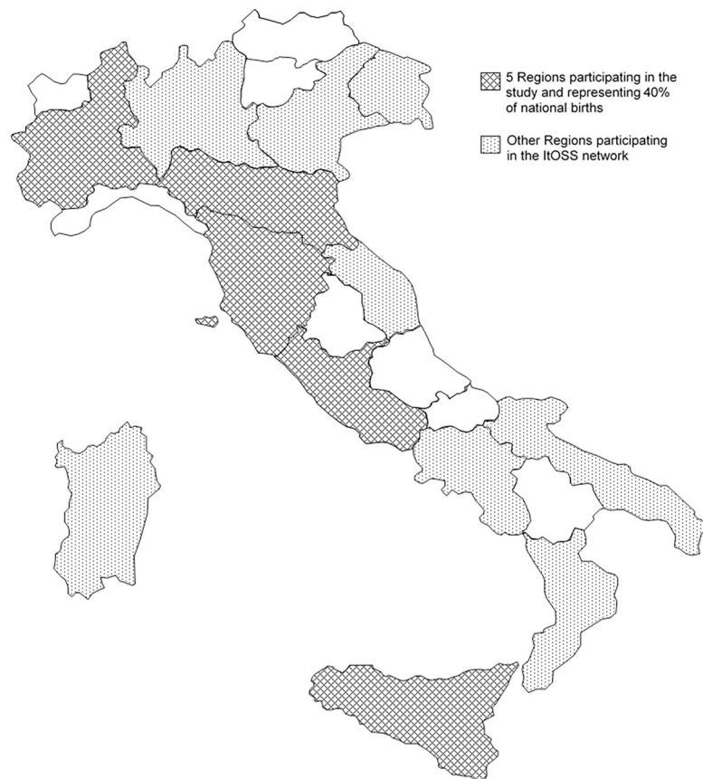
Fig 2. Italian Regions participating in the study and in the ItOSS network.

The present analysis includes only five of the Italian Regions participating in the ItOSS since its institution—i.e., Piedmont, Emilia-Romagna, Tuscany, Latium, and Sicily—covering around 40% of national live births. Guaranteeing MMR computation and avoiding estimate distortions is crucial. Therefore, the Regions were selected on the basis of their annual births ( \geq 35000 ), of the availability of vital statistics for the entire study period and of their geographical location in the country (North: Piedmont, Emilia-Romagna; Centre: Tuscany, Latium; and South: Sicily) (Fig 2).