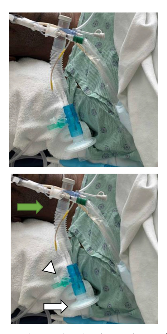
Picture 2. T -piece connected to patient: white arrow shows HME filter; white arrowhead shows oxygen port; green arrow shows connection to the endotracheal tube.

At a time where healthcare workers are at high risk of exposure to COVID-19, the above described method is a safe process for apnea testing in declaration of brain death. Recent literature has described a likely increase incidence of cerebrovascular events in COVID-19 patients. Guideline based practice remains the goal of care even in the midst of this pandemic.