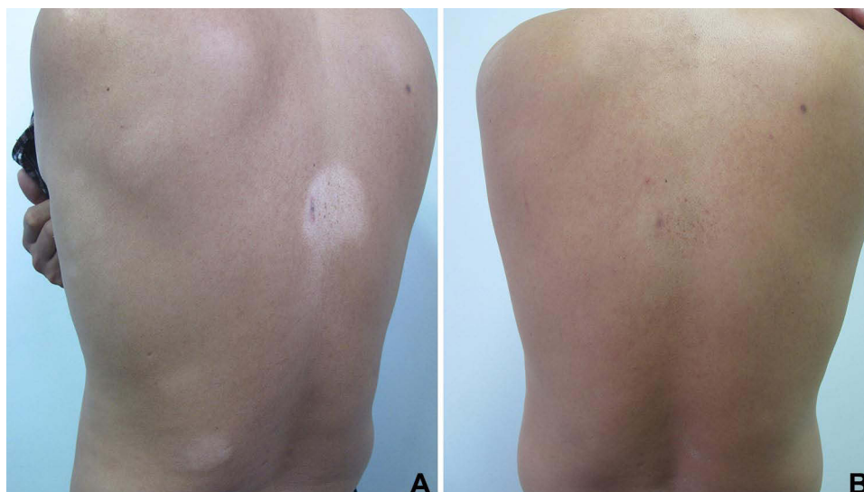
Figure 1 (A) The lesions of hMF generally presented as hypopigmented plaque or patch without obvious feelings. (B) The lesions of this patients were relieved obviously treated with topical nitrogen mustard combined with topical glucocorticoid for 1 year.