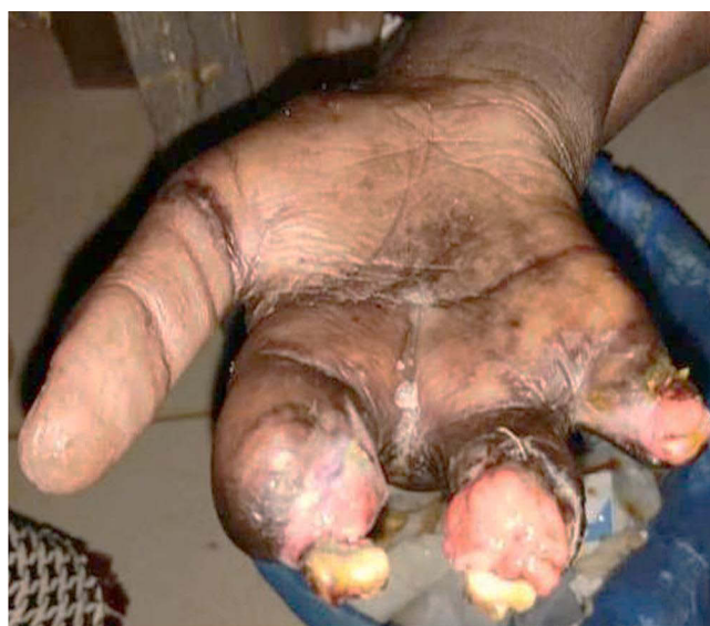
Figure 1 Right hand of the patient post middle finger amputation, demonstrating extensive digital ulceration.

Hand x-ray shows reduced bone density at the distal end of the radius and ulna, carpal bone, and metacarpophalangeal joint with a fracture in the index and ring fingers and an amputated middle finger (Figure 2).