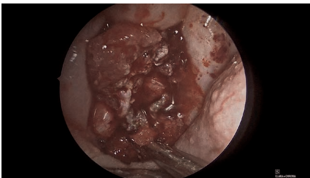
Fig. 4. Intraoperative endoscopic placement of the VLM in the nasopharynx.

mucosalization was complete for both patients. No recipient site complications were observed, although donor site seroma formation was seen in 1 patient. Average time to speech recovery was 1.5 months (range 1–2 months) for both patients. Time to diet recovery was 2 months for one patient, whereas the other was on long-term percutaneous endoscopic gastrostomy feeding. Average postoperative follow-up duration was 10.5 months (range 6–15 months), and there was 100% flap survival with no perioperative mortalities.