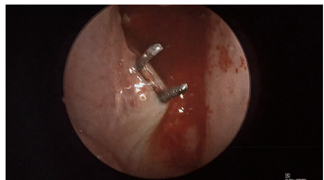
Fig. 2. Curved instrument inserted through the transcervical incision, up the parapharyngeal space and into the nasopharynx, preparing to grasp the chest tube inserted through the anterior nares for flap introduction into the posterior nasopharyngeal space with pedicle microanastomosis in the neck.