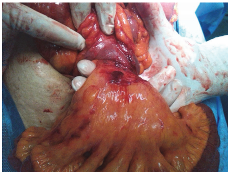
FIGURE 3: Intestinal malrotation with midgut volvulus.