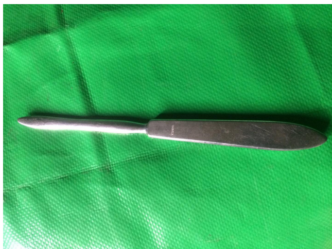
Fig. 2. A blunt ended paediatric bone lever used as an unconventional tool in levering the ring.