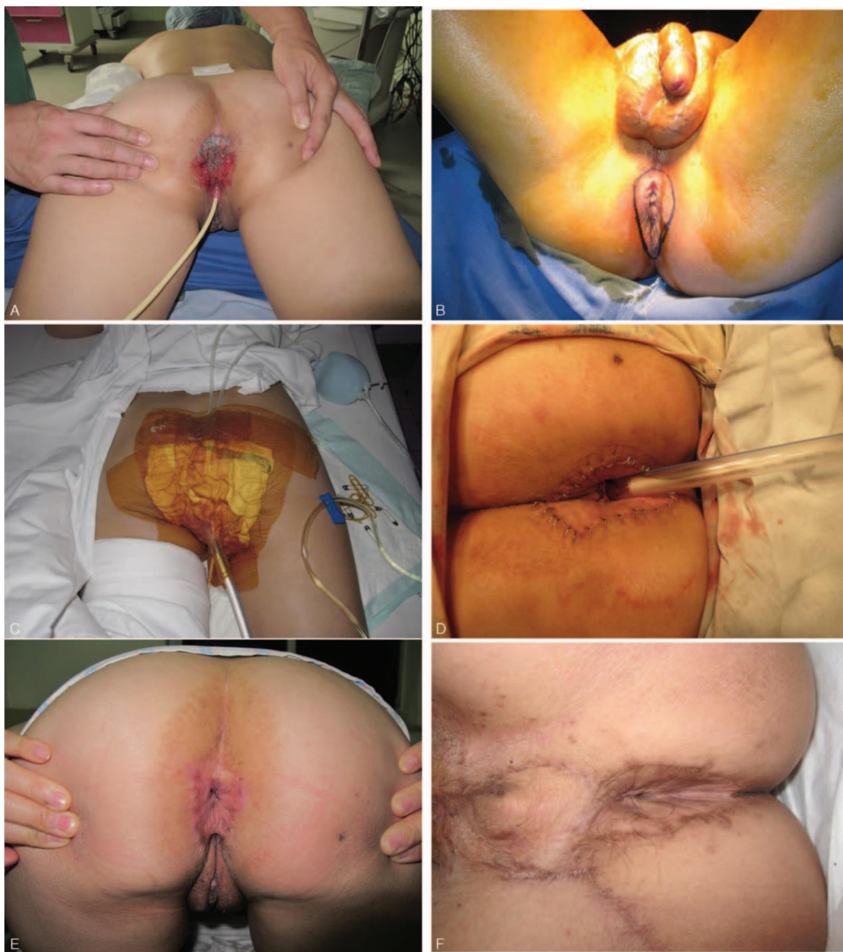
Figure 2. (A and B) Perianal Paget disease before treatment, (C and D) negative pressure wound therapy treatment after skin grafting, (E and F) 6 months after therapy. Two patients were included: a 57-year-old female (A, D, and E) and a 63-year-old male (B, C, and F).

Then, a circular hole was formed. The graft was used to cover the defect and secured by suturing it with the rectal mucosa inside and the perianal skin outside (Fig. 1B).