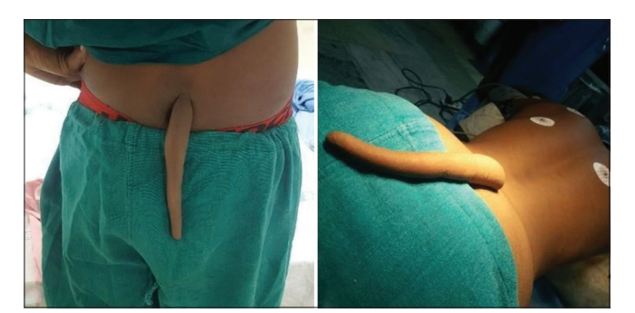
Figure 1: Preopertive images of 18-cm long human tail in the sacral region

The occurrence of tails in humans continues to be a rare and fascinating phenomenon. There is a wide variation in social status attributed to tailed humans. For most people, having a tail is a reason for fear, shame, and surprise and is considered a curse, while for some people, it is regarded as a symbol of status. In case of the Ranas of Porbunder in India, rulers of Rajput tribes, a tail was considered a