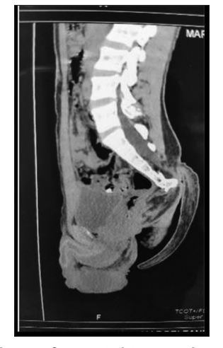
Figure 2: Sagittal image of computed tomography scan showing tip of coccyx everted toward base of tail. This everted bony spur is reason for pain while sitting

Virchow<sup>[12]</sup> in 1880 probably first classified human tail into three categories as follow: (a) Cauda perfecta – tails containing vertebrae, (b) Cauda imperfect – tails without vertebrae, and (c) various protuberances that resembled tail (pseudotails). Virchow's classification system was never widely adopted.