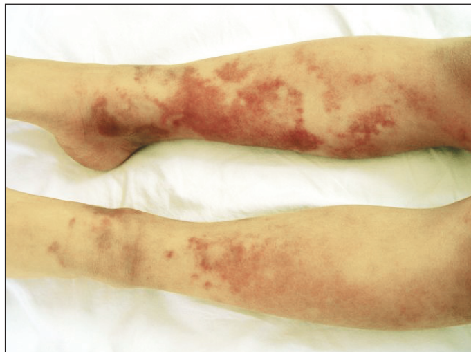
Figure 2: Red and purple-colored, slightly infiltrated, geographic patterned ecchymotic patches in various sizes on below-knee region.

hospital. The patient was given bed rest. On d 5 of hospitalization the rashes became pale and over the course of the next 5 d disappeared completely. The patient was then discharged and knowledge was given that this benign disorder would recur especially due to stresses to his parents. No dermal findings or patient complaints were noted at the 10-d post-discharge follow-up.