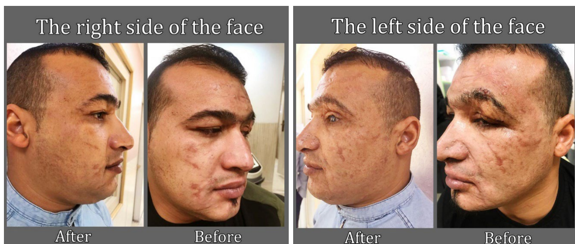
Figure 3: Photographs taken before and after the injection (Left and right sides). Pictures demonstrated improvement of regeneration of dermal tissue and autologous fibroblast and melanocyte injections produce safe and efficient improvements of dermal defects.