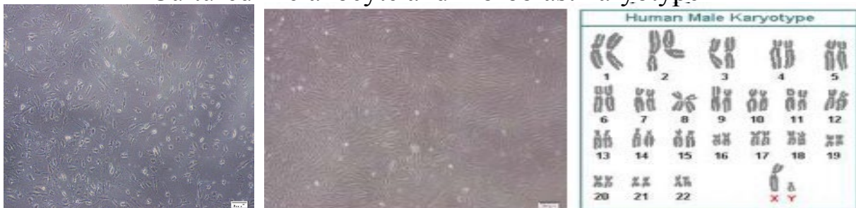
Figure 2: Our observation showed normal 45XY karyotypes in this patient, with no evidence of abnormality.