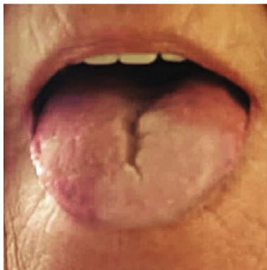
FIGURE 2: Picture of the oral tongue demonstrating left-sided tongue pallor.

with a previously diagnosed systemic sclerosis with digital Raynaud's symptoms [3–8].