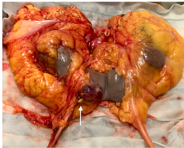
Fig. 1. Horseshoe kidney harvested en bloc. Artery accidentally injured during extraction (arrow).