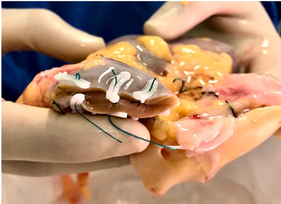
Fig. 3. Isthmus final appearance after hem-o-lock placement.

parenchyma. It is equivalent to the renorrhaphy performed after partial nephrectomies, where it is not uncommon to see large parenchymal defects that frequently include urinary collecting system.