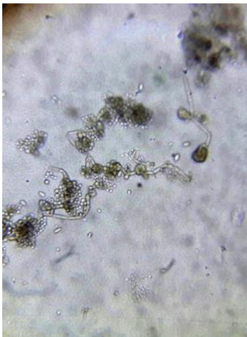
Fig. 3. Microscopic examination of culture. Hyaline budding yeast-like cells, ovoid to elliptical, with thin wall. Pigmented (dematiaceous), septate and branched hyphae, with annellidic conidiophores that produce round to ovoid conidia of different sizes, with a thin smooth wall, that accumulate in slimy balls at the apices of the annelids or down their sides forming mucosal aggregates.

fluid culture was negative. During the procedure a liver biopsy was done, later showing cirrhosis.