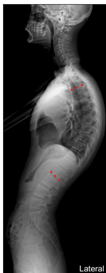
Fig. 3. Lateral whole spine X-ray of a 15-year-old boy with Scheuermann's kyphosis. Cobb's angle was 65^\circ . The patient was treated surgically.

The comparison of mean changes in results between the two groups showed a significant difference in all QOL scores and Cobb's angle ( p < 0.05 ) (Table 4).