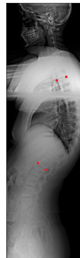
Fig. 2. Lateral whole spine X-ray showing Scheuermann's kyphosis at final follow-up after conservative treatment. Cobb's angle was 64^\circ , which means no improvement.