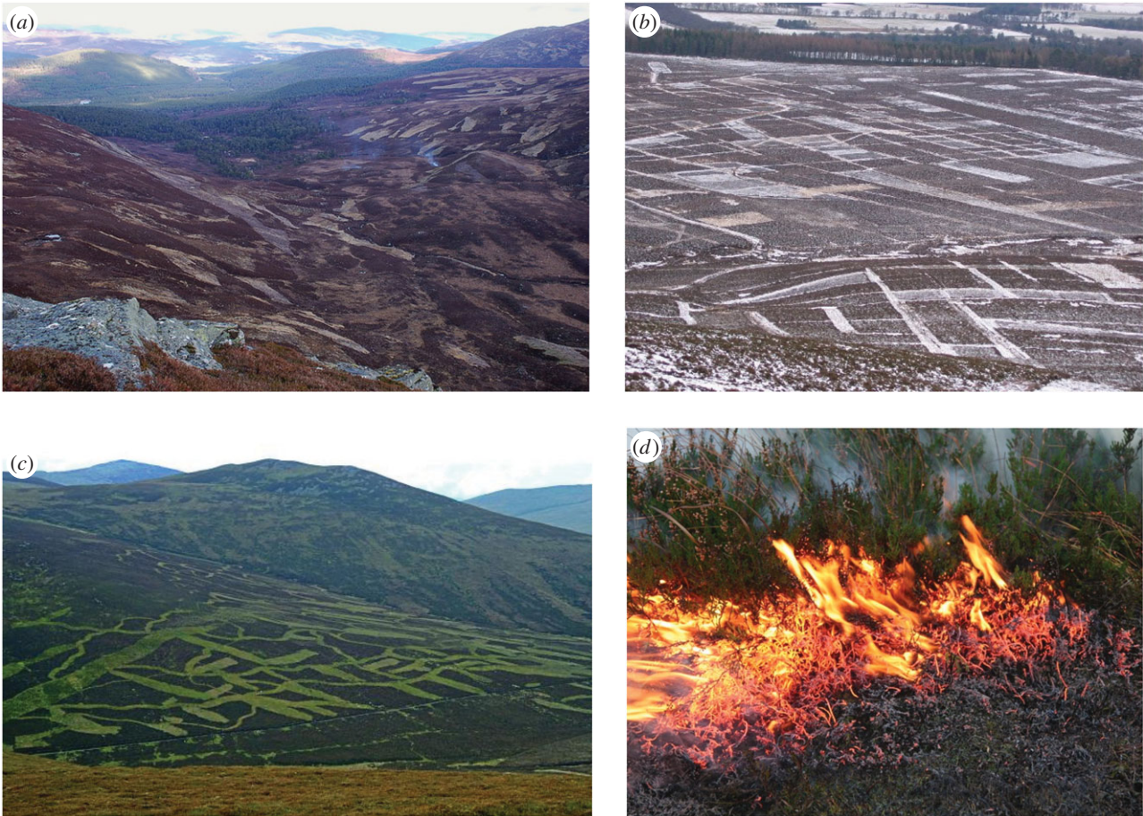
Figure 1. (a–c) Examples of moorlands managed through forms of prescribed burning typically associated with grouse moor management. Fire can, however, be used as an ecological tool for much more than just grouse and sheep production. Even grouse moor burning practice varies widely across the UK as can be seen here. Prescribed burning drives a variety of changes in peatland ecosystems including a range of ecosystem benefits and impacts according to the temporal and spatial scale one considers. Depending on how fires are managed, the ecological, visual and aesthetic impacts can be greater or lesser. (d) A low-severity prescribed burn moving through the lower canopy of a stand of Calluna , the moss and litter layer covering the peat surface is left more-or-less untouched. (Online version in colour.)