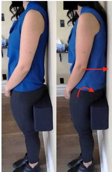
Fig. 3. Mirror image exercise. Left: The patient stands with a block trapped midway down buttocks to the wall. The patient is leaning backwards so the shoulders are touching the wall. Right: The exercise is performed when the patient attempts to pull the lumbar spine to the wall; this creates a posterior pelvic tilt and a posterior thoracic translation position. Exercises were performed for 50 repetitions and held for three seconds.

A second follow-up assessment 9 months after the last exam (13 months overall) and after 38 further treatments (73 treatments overall) demonstrated that she continued to get well. She reported her LBP and hip pains rarely bothered her; only on occasions where she would ‘over do it,’ and even then it would only be a minor ache for a short time period. She rated her pains a 0/10 on average and a 1–2/10 at worst and scored a 4% on the ODI. All other tests were unremarkable. The second follow-up lateral lumbar radiograph showed continued biomechanical improvements from the initial subluxation pattern. Overall, (since the initial assessment) the lumbar spine hyperlordosis reduced 8° ( -47.1^\circ vs. -54.9^\circ ), the forward sagittal balance reduced 17.4 mm (7.6 mm vs. 25.0mm), and the sacral tilt reduced 5° ( 48.1^\circ vs. 52.9^\circ ).