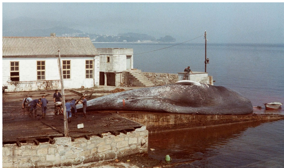
Figure 2. The 22,40 m long blue whale caught by the catcher boat IBSA DOS on 24 July, 1978, and brought to the Cangas (Balea) land factory for flensing.