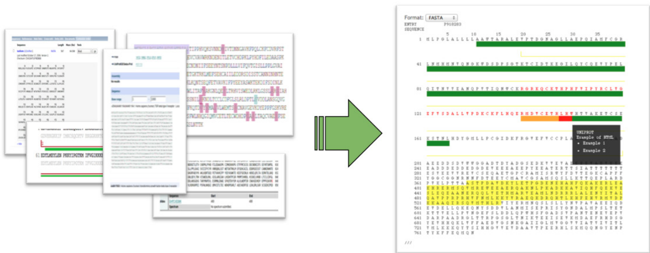
Figure 1. Multiple representations compiled as one flexible BioJS component.

As any other BioJS component, the Sequence component is well documented and has been tested during development, not only for functionality but also for usability. BioJS makes it easier to document the code by adding annotations that are later exposed as a web page. Thus, human-friendly documentation is generated without