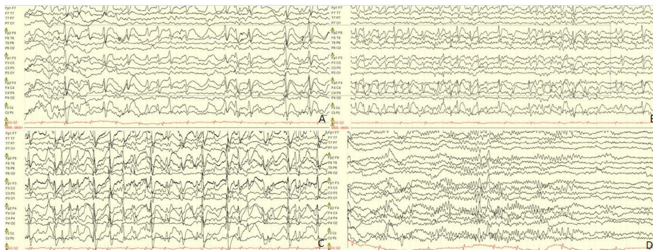
Fig. 3. Subsequent sleep EEGs and treatment modifications A. Spike-wave index calculated at 60% leading to clobazam initiation. B. Several weeks later, spike wave index calculated at 70–80% leading to high dose diazepam trial and oxcarbazepine discontinuation. C. Several weeks later spike wave index calculated at 90–95% leading to corticosteroid trial. D. Several weeks later no interictal discharges noted on 24 hour video EEG. EEG settings: Bipolar montage; LP 1 Hz, HP 50 Hz, 15uV/mm, 10seconds/page.

A year later, and nine days following initiation of corticosteroid administration (Fig. 3 after panel C and before panel D), a third neuropsychological evaluation was completed as a part of a pre-surgical work-up. As such, the battery of tests administered was modified slightly according to the institution’s presurgical epilepsy battery. Importantly, the patient had been started on stimulant